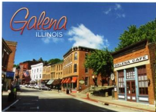
Galena, IL –Main St.