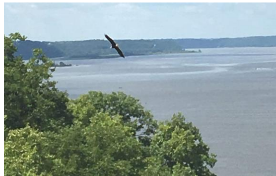
An Eagle Soars Above Eagle Point Park