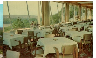
Timmerman's Supper Club