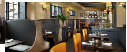
Carolines Restaurant Within Hotel