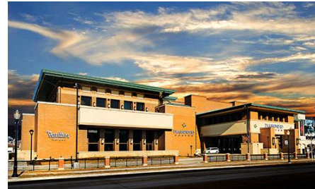
Diamond Jo's Casino - Port of Dubuque