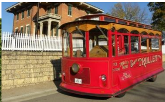
Galena Trolley Tour (Optional)