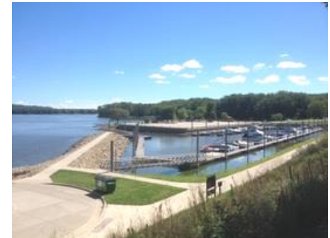
Guttenberg, IA Harbor