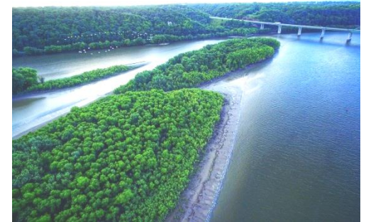
Mississippi R. Near IA-WI Bridge