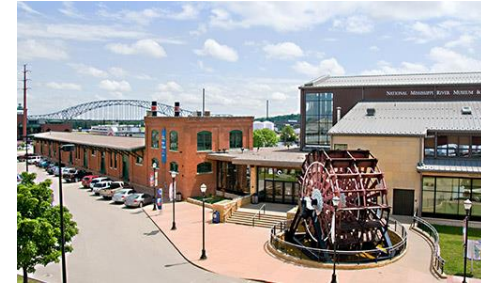
National Mississippi R. Museum - Aquarium