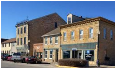
Guttenberg, IA – Quaint Main St.