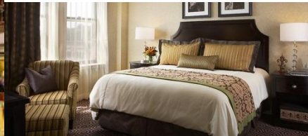
Typical Guest Bedroom