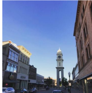
Dubuque's Town Clock Plaza

4:00 PM Estimated arrival time in St. Charles, IL. Those who have a Metra train back to their point of origin will be brought back to the Elgin station.