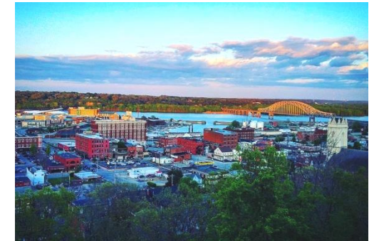
Panoramic View of Dubuque, IA