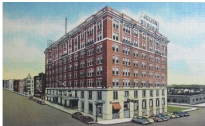
Restored Julien Dubuque Hotel And Lobby