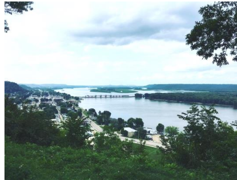
Mississippi R. Near Bellevue, IA