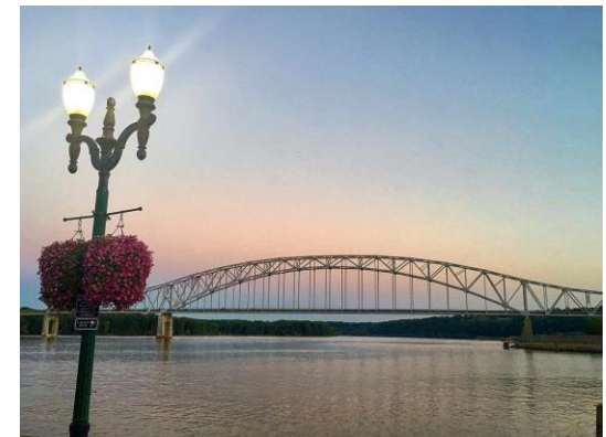
Sunset At The Julien Dubuque Bridge